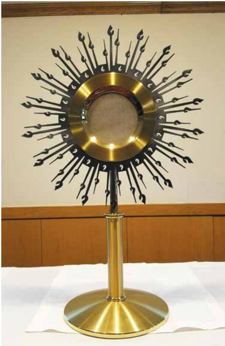
St. Anne and St. Catherine parishioners have the opportunity to spend time in prayer with our Lord in the Blessed Sacrament, twice each month at Eucharistic Adoration.