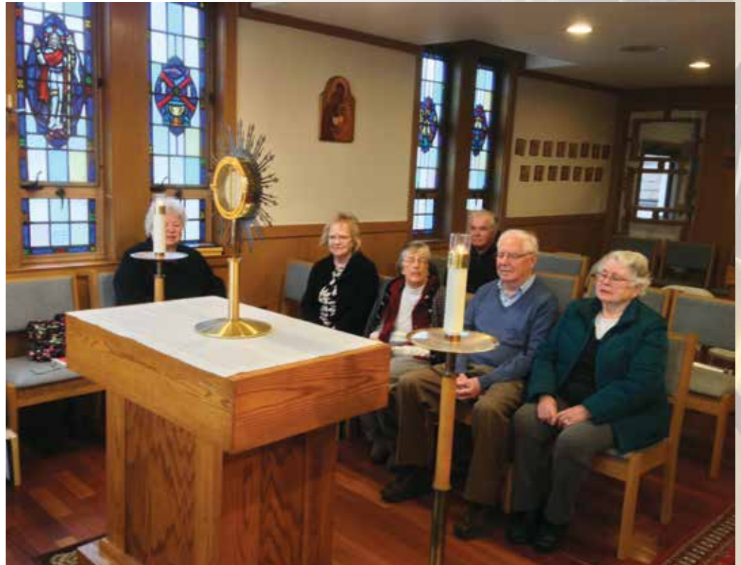
Adorers spend time in the Real Presence of Christ in Eucharistic Adoration.

“St. John Vianney saw this peasant who would come and spend time with the Blessed Sacrament, and he asked the peasant one day, ‘What do you pray about?’” he says. “The man said very humbly,